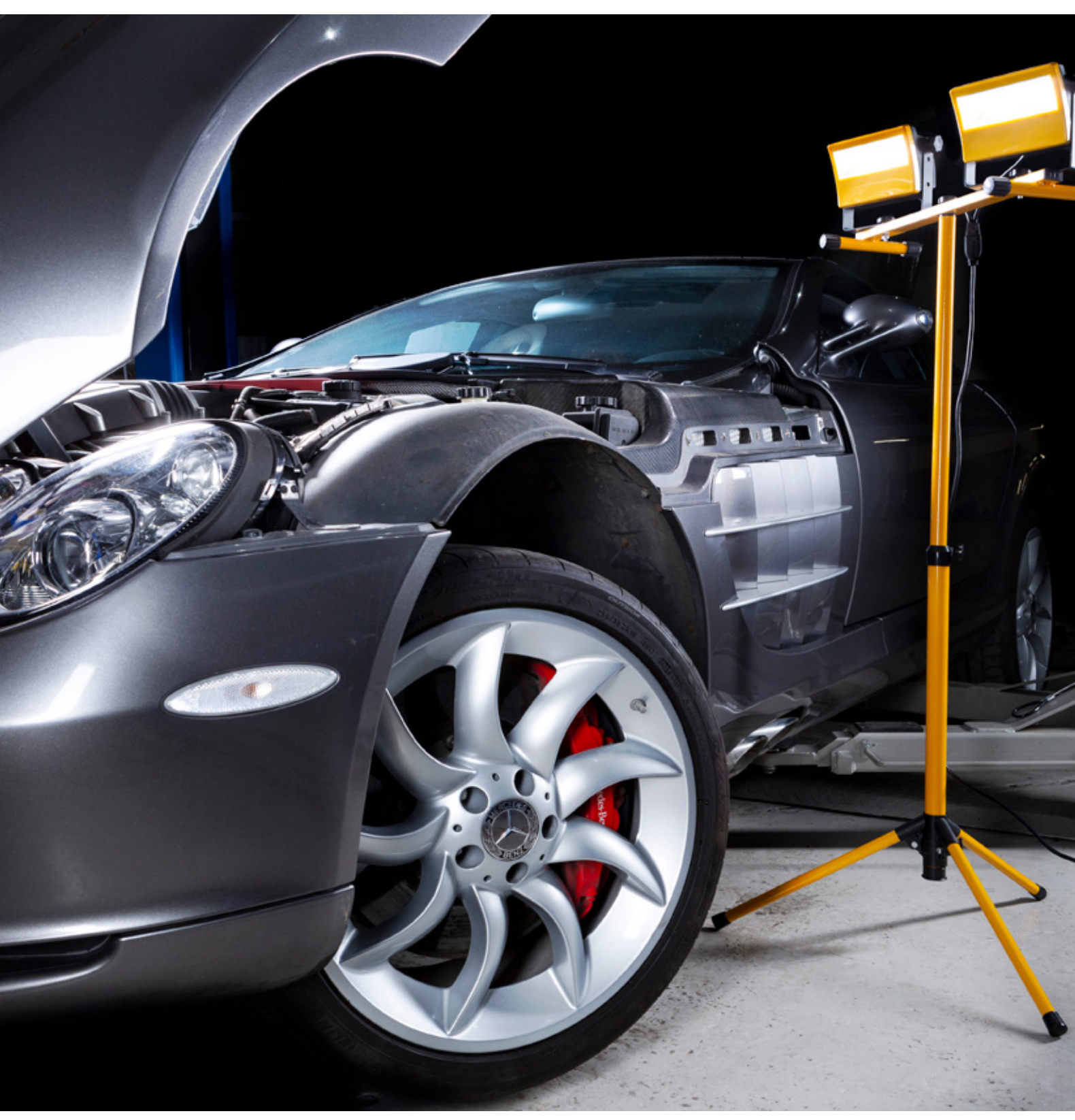
Garage Workshop Products